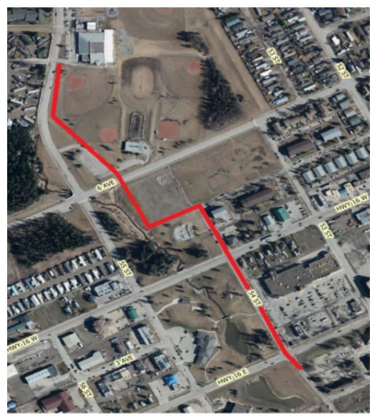
54th Street Sanitary Upgrade Project Limits